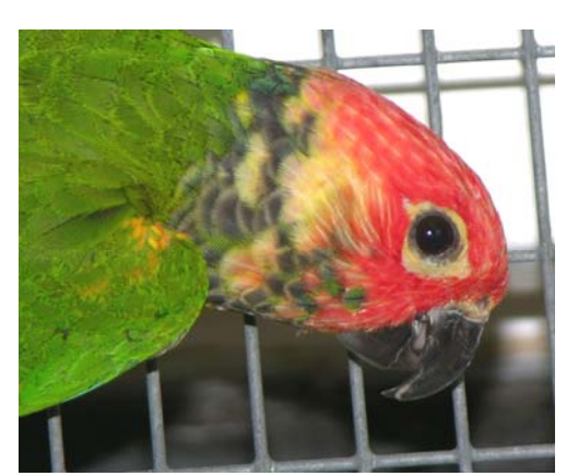
Adult picta roseifrons painted

Unlike the Painted which seems to be difficult to breed at times, it has been my experience that the Roseifrons are very sweet and prolific birds.