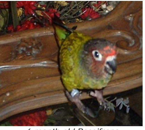
6 month old Roseifrons getting his red head

Because the roseifrons are not as available in the U.S. as some other Py species, they will likely continue to be at the higher end of the Py pricing (as compared to green cheeks, for example) for some time to come.