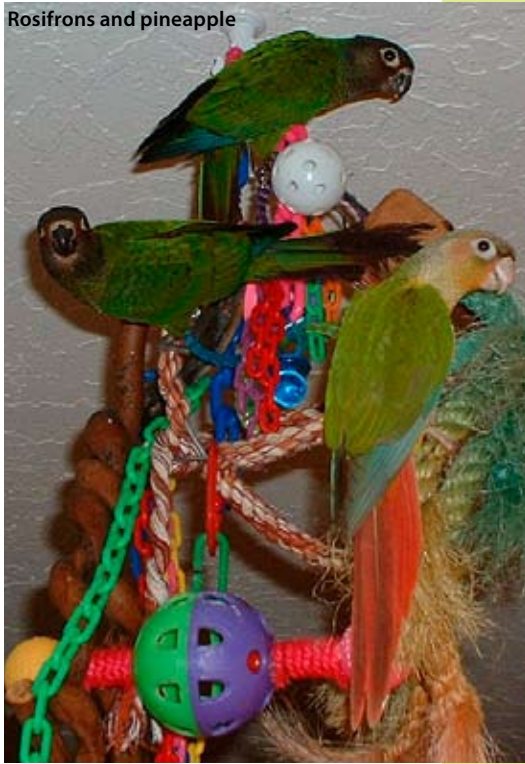
Rosifrons and pineapple