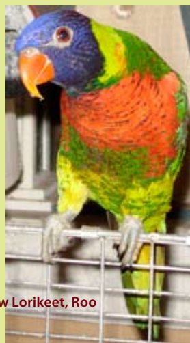
Rainbow Lorikeet, Roo