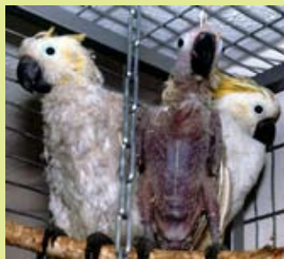
Three birds each in different stages of the disease.

“PBF D isn't as common as it used to be.” This is not true. While PBF D has been around for a long time, it hasn't been eradicated. There are likely more infected birds than are reported now because most people don't test a healthy looking bird.