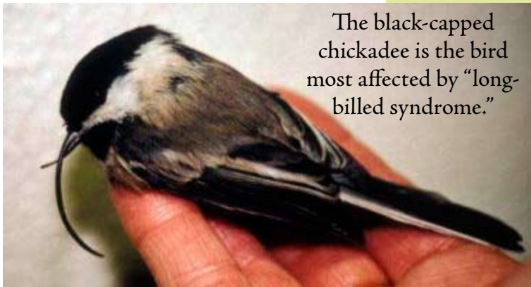
The black-capped chickadee is the bird most affected by "long-billed syndrome."