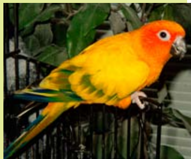
Sun Conure, Soleil