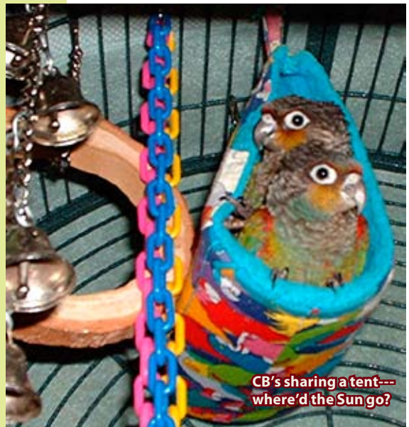
CB's sharing a tent--- where'd the Sun go?