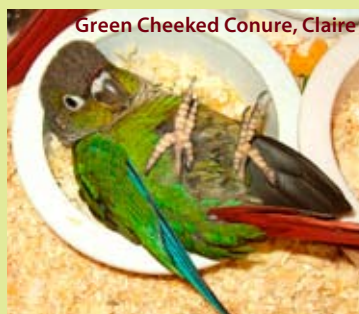
Green Cheeked Conure, Claire