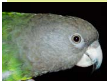
Brown Headed Parrot, Jordy