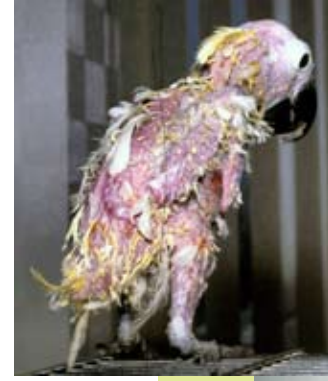
A Cockatoo and African Grey