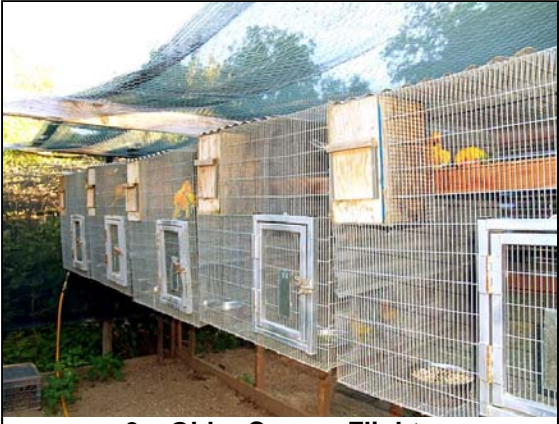
3 – Older Conure Flights