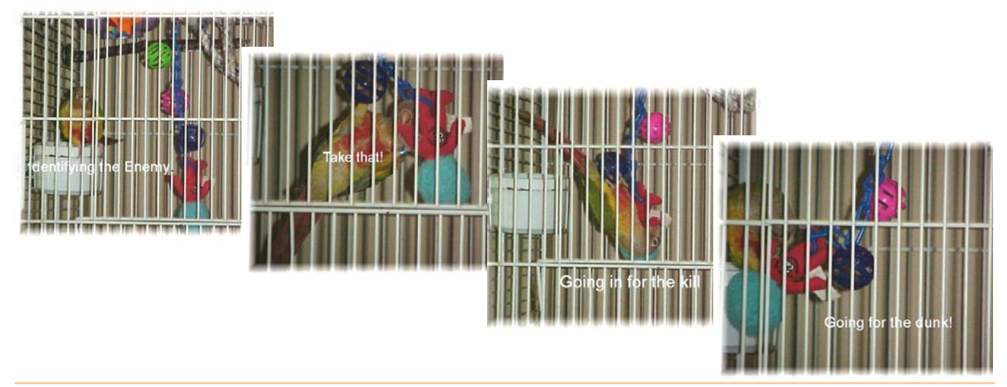
Who says green cheek females are timid? They have the killer instinct too! Or at least Sweet Pea does!