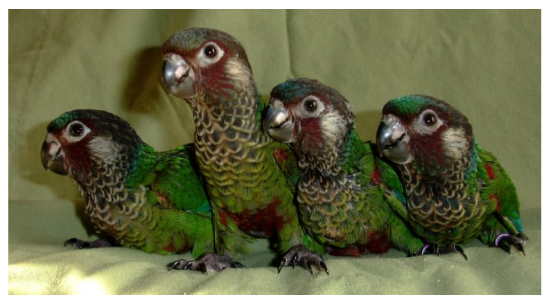
... to jewel-colored fully-feathered beauties