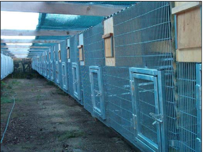
2 – Older Conure Flights