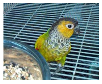
The Py Press - Summer 2006 Newsletter