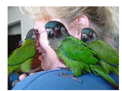
Babies don't know that beaks and eyelids don't go together.

More than anything, I want my birds to have happy lives. I share my space with them and I do not like to be bitten...so this means that all of my birds need to behave as members of the family. I didn't realize this was radically different than what many other bird breeders do by keeping pets as pets and breeders separate.