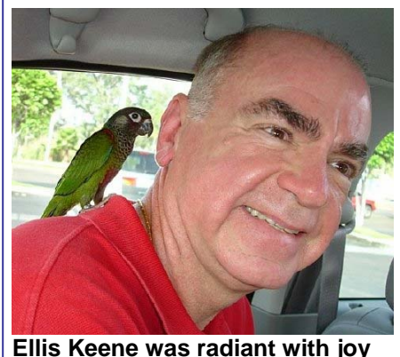
when he met "Gracie."

be successful as a breeder, then I would need to be content with having her as a happy and healthy pet.