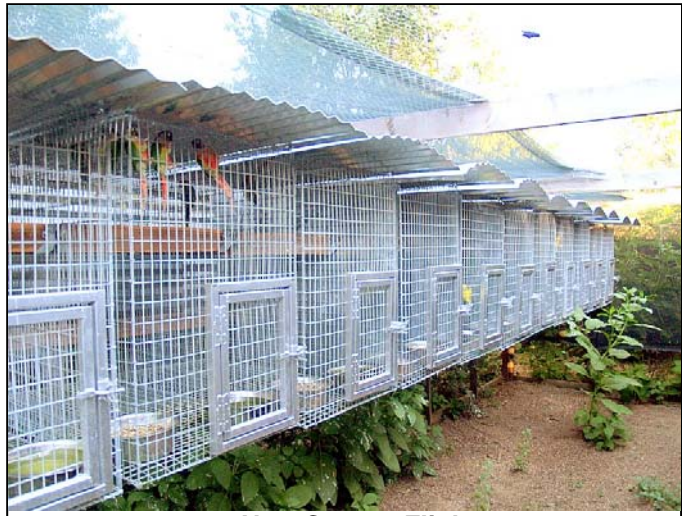
1 – New Conure Flights