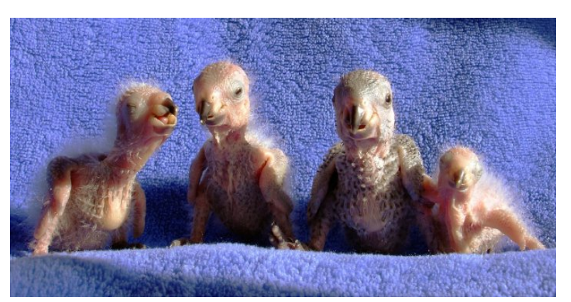
From the "baby dinosaur" look

Well, there it is. My breeders are pets. Treasure still likes to ride around on my shoulder while I do household chores. She gives big smoochie