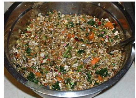
Dish for youngsters