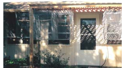
Outdoor aviary enclosure