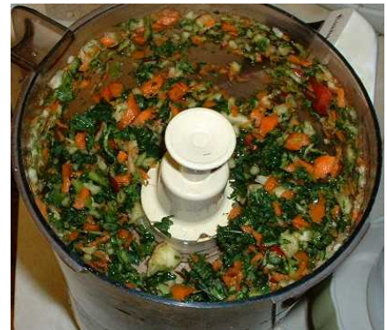
Breakfast for the "bird gang"