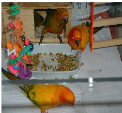
Sun parents visiting youngsters in plexibrooder with sleepbox