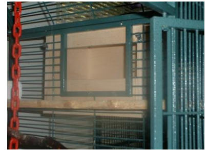
Outside cage mount