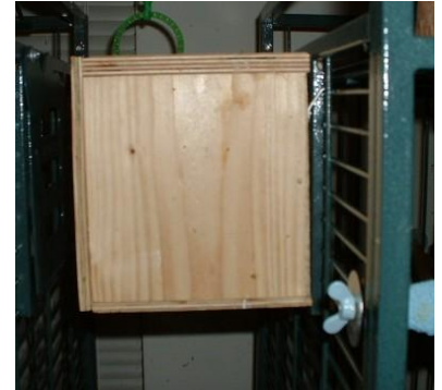
Sleepbox in pet carrier for shipping