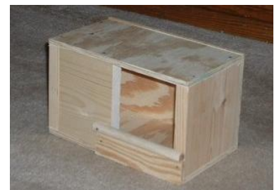
Smaller Single Py Box