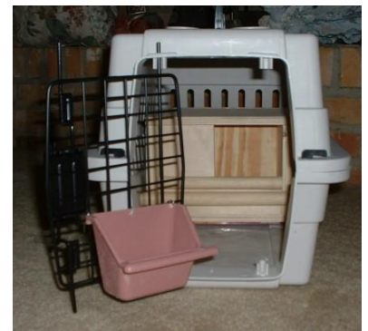
Sleepbox in pet carrier for shipping