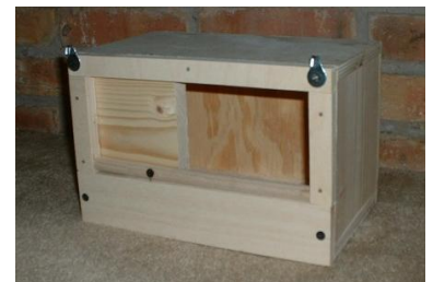
Inside cage mount