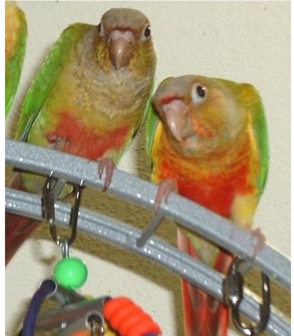
Cinnamon (left) and Pineapple (right)

A cinnamon-yellowsided, or “pineapple,” is a visual color manifestation resulting from a combination of color genes which then exhibits characteristic colors of both cinnamon and yellowsided. When compared to a cinnamon, a pineapple should have extra red and yellow—particularly notable under the wings. In a cinnamon, the yellow may be bright, but it will also have a lime green cast to it, whereas the pineapple’s yellow will be bright with no lime green cast. The cinnamon will not have reddish orange around the lower mandible feathers, but the pineapple usually will, and in addition, will have some red above the cere. The pineapple’s tail will also be telltale of the yellow-sided influence, so that if you look at the tail feathers from above, you will see a slight “halo” of lighter color around the tips of the feathers. This also gives the tail an almost translucent red tinge. The cinnamon color will be more muted and will not have that “halo.”