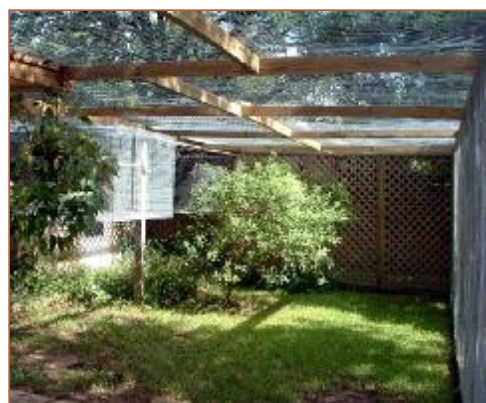
(Left) Outer aviary enclosure and suspended flights