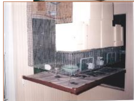
(Above) Suspended indoor cages with bumpouts for food and water, with nestboxes hanging over bumpouts