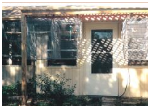
(Above) Suspended flights connected via portals under eaves to indoor cages

In addition to indoor cages, I have an enclosed "bird porch" on the back of my house. There are several indoor/outdoor (connected by portal) flights, some of which house Pyrrhura conure breeding pairs, and larger ones which house Indian Ringnecks. I can service cages totally indoors, without having to go out in the weather, and the birds have their choice of being indoors or outside in the weather. I have enclosed the entire outside aviary area to keep out large predators. This also allows me to go outside and enjoy the fresh air with flighted pet birds.